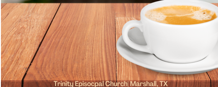
Trinity Episcopal Church | Marshall, TX

Join us for a study titled A Man Called Peter. We journey with Peter through Acts and 1 & 2 Peter. This flawed man of great faith is the rock upon whom God built his church.